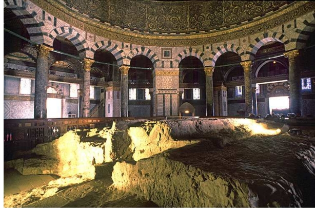
Inside the Dome of the Rock. Waiting for the final renovation and Papal throne.

The reason this is so critical for S.D.A.'s and other truth seekers of all denominations, is that the correct dates of the crucifixion cannot be achieved by using the Julian/Gregorian calendar. If the calculations are off even by a day, then it would be discovered that successive weeks had been broken and their day of worship would in effect not be sacred. This is