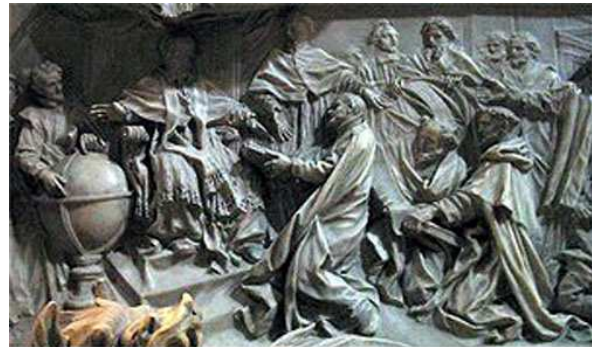
Pope Gregory XIII, celebrating the introduction of the Roman Gregorian Calendar in 1582.

Make no mistake, portrayed in the image below is none other than the Crest of Pope Gregory as displayed at the Vatican. Here we see that not by mere chance the "crest of the dragon" represents Pope Gregory in whom Roman Gregorian calendation is named for. In the sixteenth century it was he who made the final touches to Roman solar calendation and then changed its name from "Julian" to "Gregorian." It is under this banner (crest), representing man-made counterfeit units-of-time, that