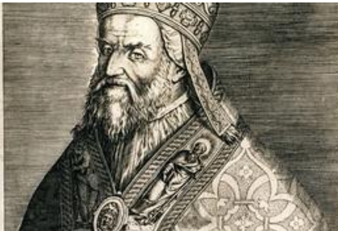
Pope Gregory XIII

For the 428th straight year, much of the world will again use the familiar Gregorian calendar. We will suffer the fiscal quarters of varying lengths and the 52 weeks that don't quite fill the year. We will recite rhymes to recall how many days are in June, and shrug if we are asked whether Halloween is on a weekday.