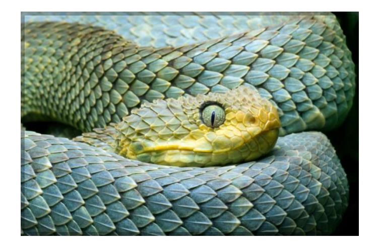
THE SERPENT'S BLOOD By Jonathan Cahn

"Blessed are those who hear the joyful call to worship, for they will walk in the light of your presence, YAHUAH. They rejoice all day long in your wonderful reputation. They exult in your righteousness." Psalms 89:15-16